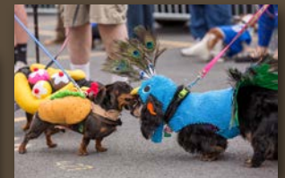
A Rare Sighting of a Hot Dog and a Peadachs

Long Dog races are so much fun and the WMDF Dachshund Dash, Corgi Chase Cup and Bassett Boogie are no exceptions. Some racers speed off to the end of the 35 foot AstroTurf track once they zero in on their custom 'bait' whether it be a family member, a toy or a treat. Other racers decide it is a social hour and hang around the starting gate mingling with the other racers oblivious to their owners calling out their names at the other end of the track, and still others just mill around looking confused not sure what they are supposed to do -- they just know mom or dad took their leash away and lots of humans are laughing and cheering and gesturing. But heck, that's what makes the races so much fun. You never know what to expect. Whether your baby is a seasoned runner or a novice, longdog races never get boring.